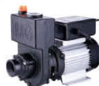
15 ZDK直流无刷 自吸离心泵系列