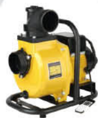
01-02 智能变频永磁 无刷直流自吸泵