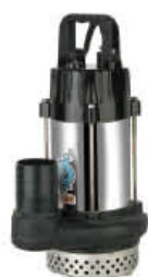
05-12 ZQB直流 潜水泵系列