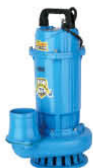
03 ZQB直流无刷 智能潜水泵系列