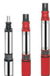
14 ZQB直流 深井潜水泵系列