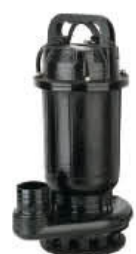
04 ZQB直流 无刷潜水泵系列